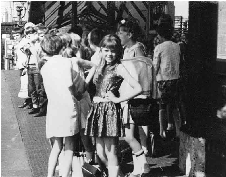
Fig 5 Outing To The Zoo from West Ham Station, me far left!!