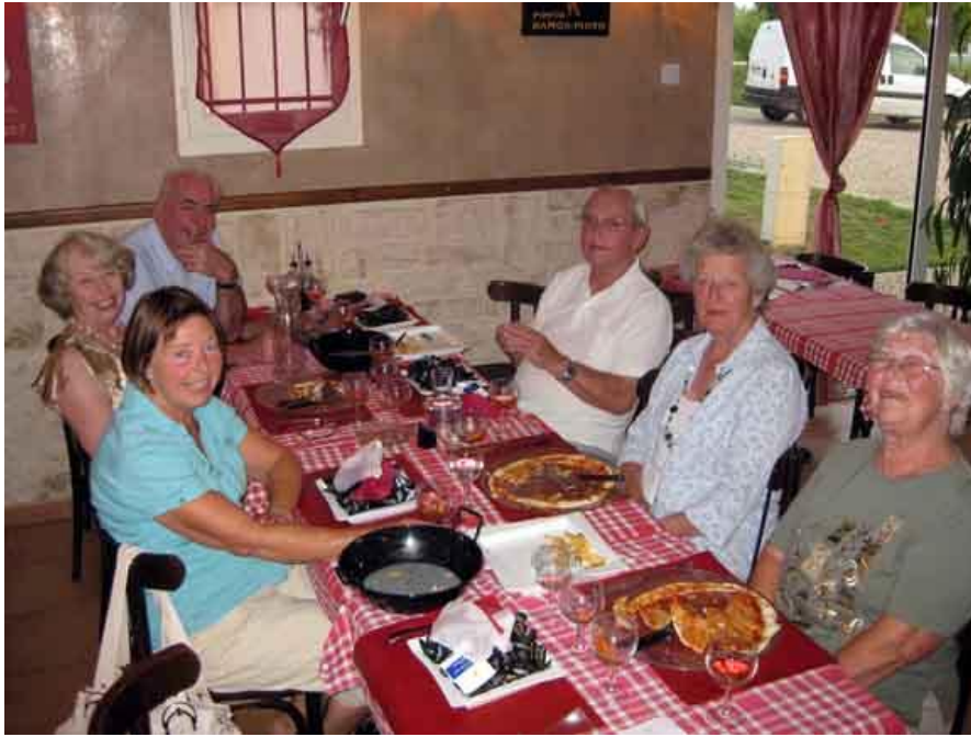
Fig 30 Restaurant Treat