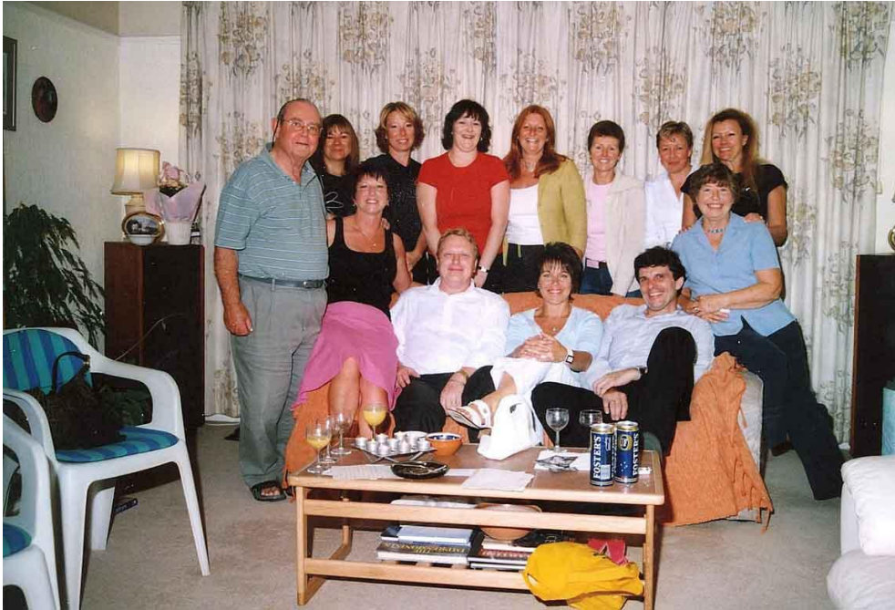
Fig 18 Class Reunion 2004