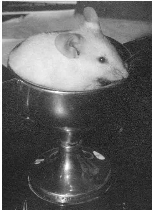
Fig 13 My White Mouse