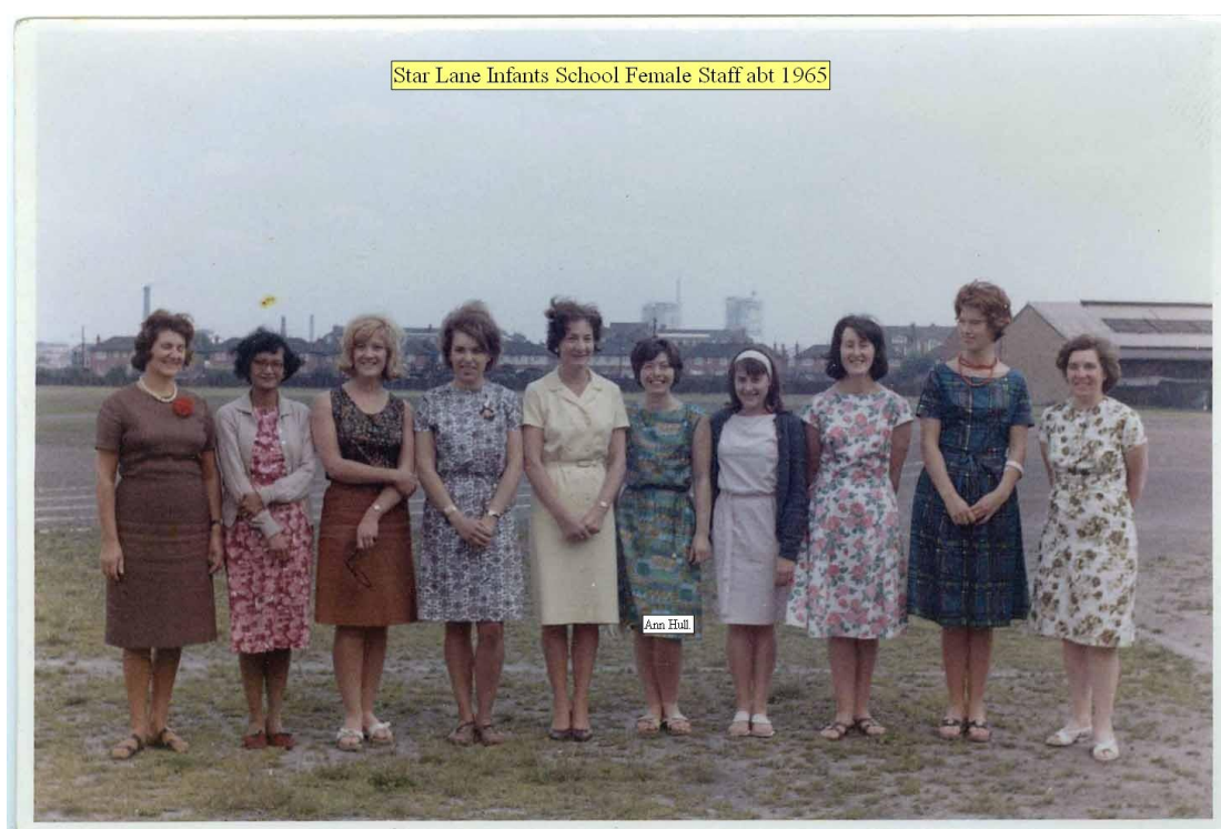
Fig 1 Star Lane Infants School Female Staff