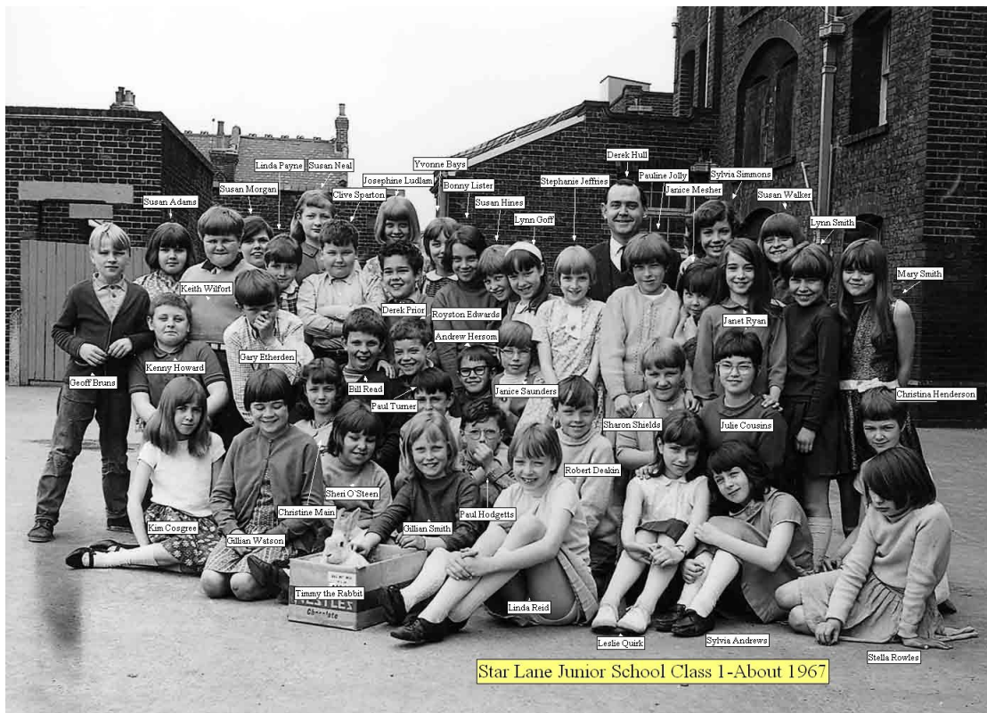
Fig 3 Class 1 about 1967