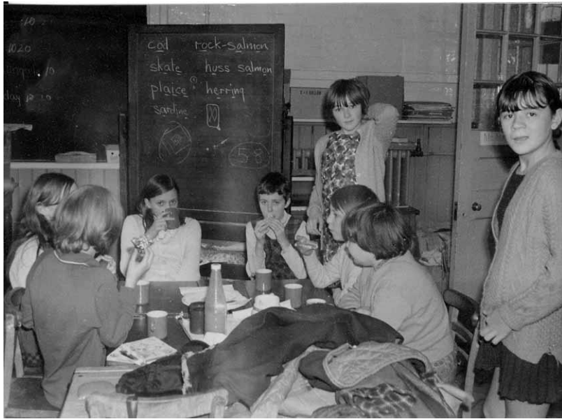
Fig 10 Class 1 Girls at Break