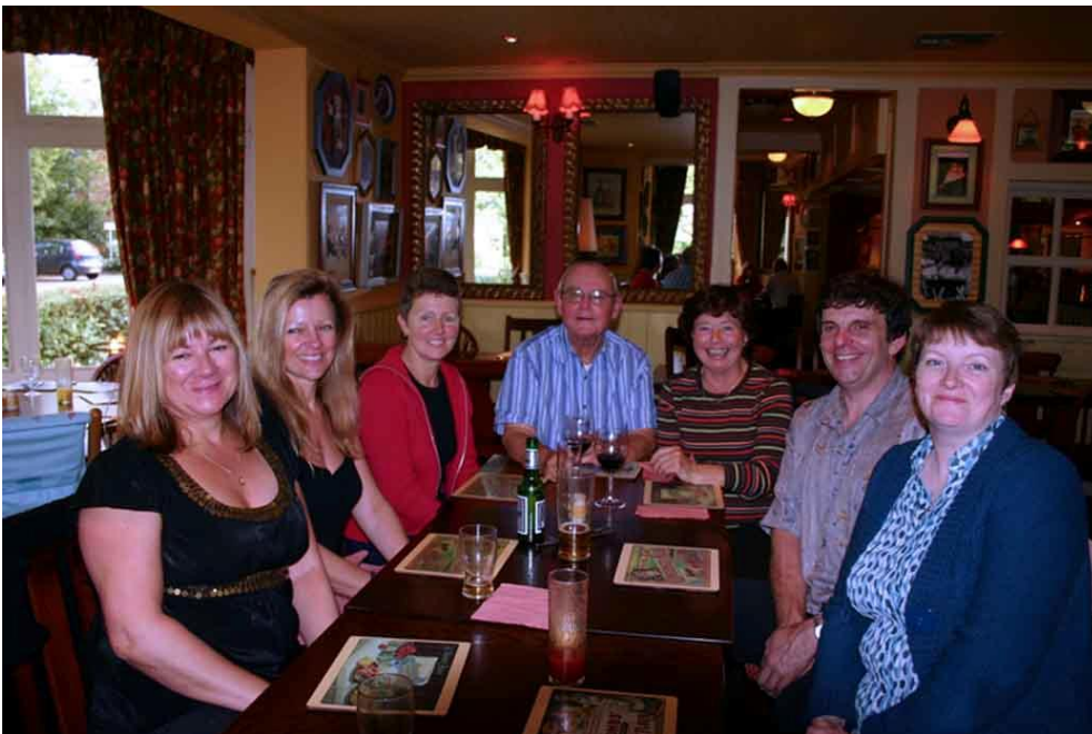
Fig 19 Class Reunion 2007