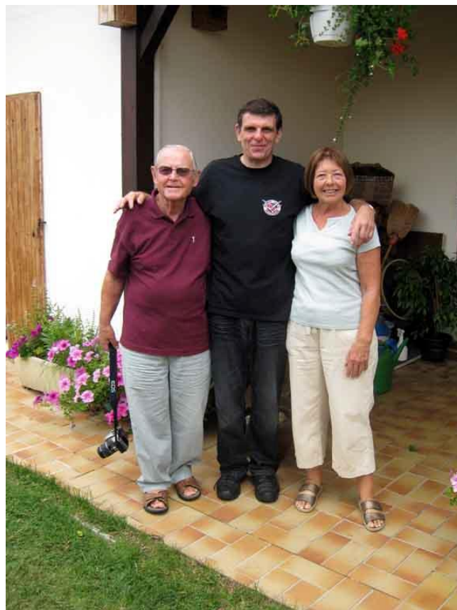
Fig 30 Goodbyes