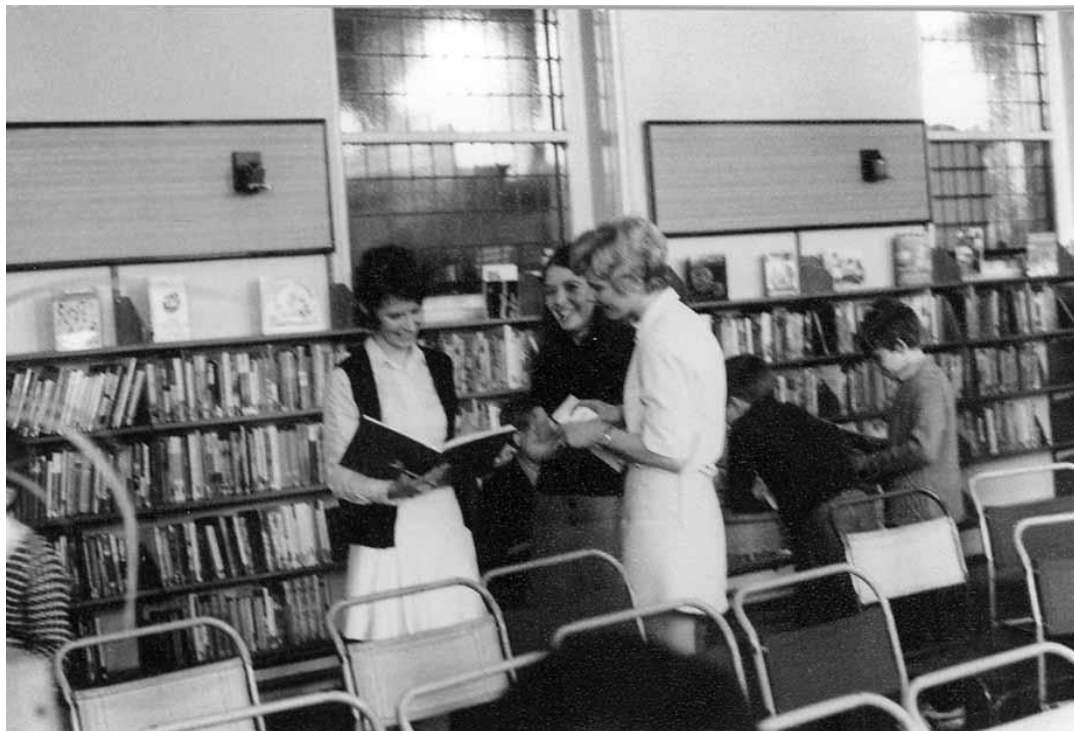
Fig 9 Canning Town Library