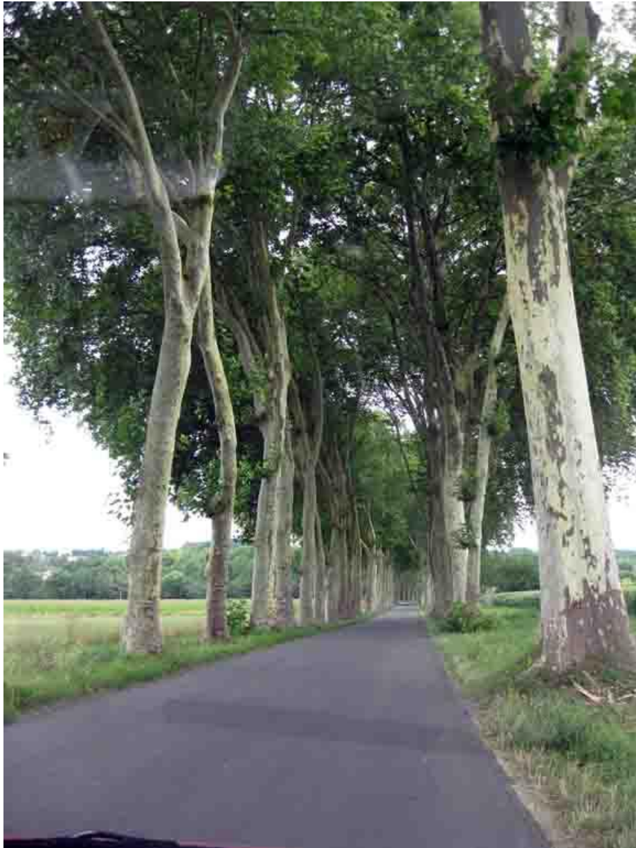
Fig 22 Avenue of Trees