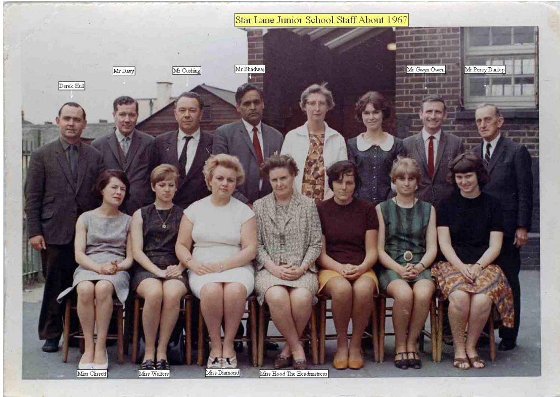
Fig 2 Star Lane Junior School Staff about 1967