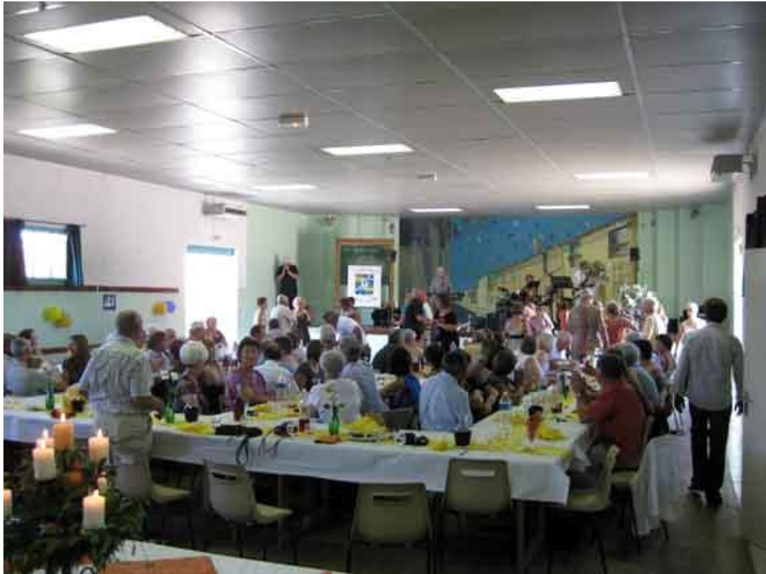
Fig 23 Party Time