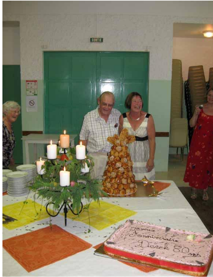
Fig 27 Wedding & Birthday Cakes